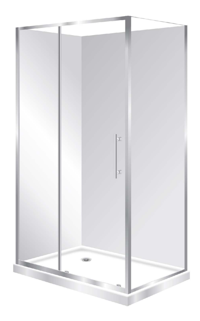
Pictured - Aquero 12 x 8 2 Panel Slider Silva LEFT HAND FLat Wall SKU S12X8LHSIFWZ