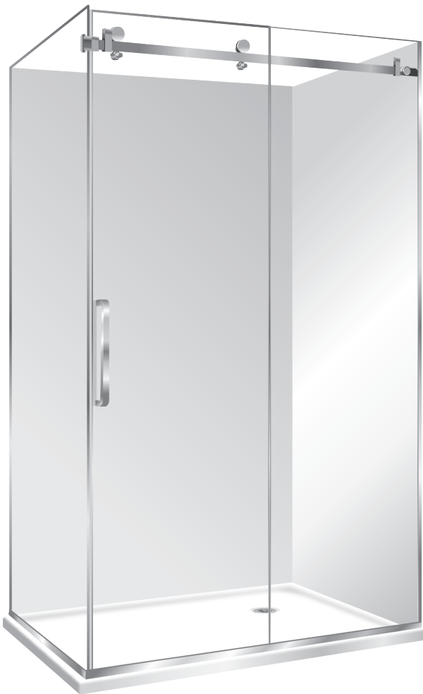
Pictured - Premier Frameless 12 x 1 2 sided RIGHT HAND .