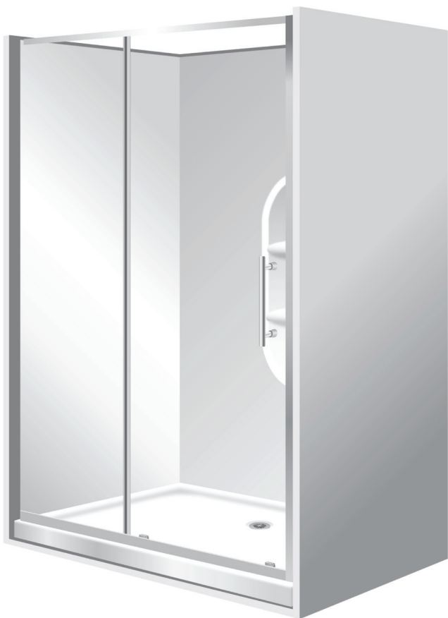
Pictured - Aquero Alcove 900x1200x900 2 Panel Sliding Door White, Moulded Wall