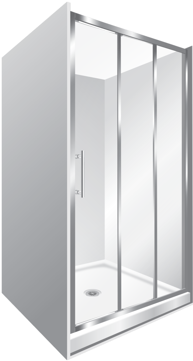
Pictured above - Aquero 1200 x 800 Alcove 3 Panel Stacker Flat Wall Silva SKU S8X12X8AQASIFWS