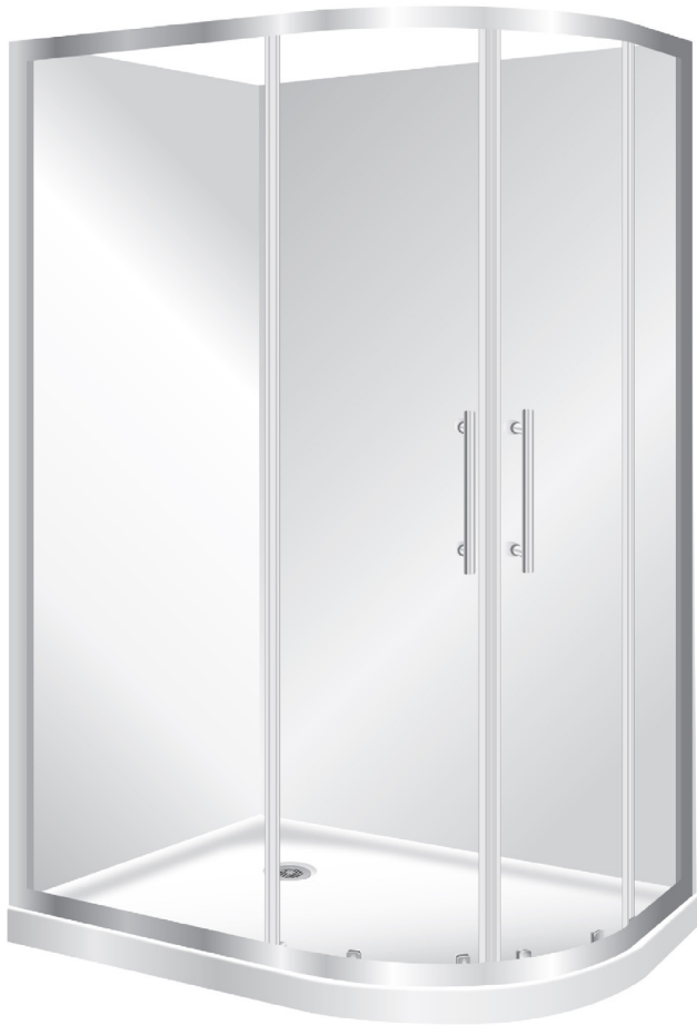
Pictured Above - Curvato 1200 x 800 LH Silva Flat Wall SKU CR12X8SIFWLH