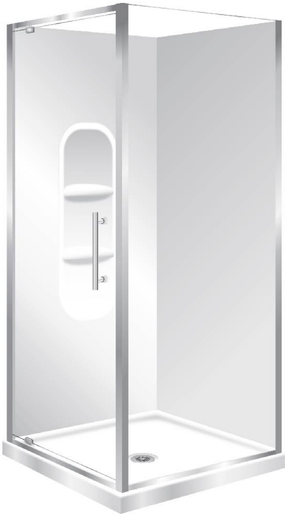
Pictured Above - Aquero 9x9 Pivot Door Silva Moulded Wall