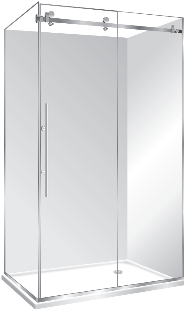
Pictured - Premier Frameless 1200 x 1000 2 Sided Silva RIGHT HAND Fixed SP12X1SIFWRH