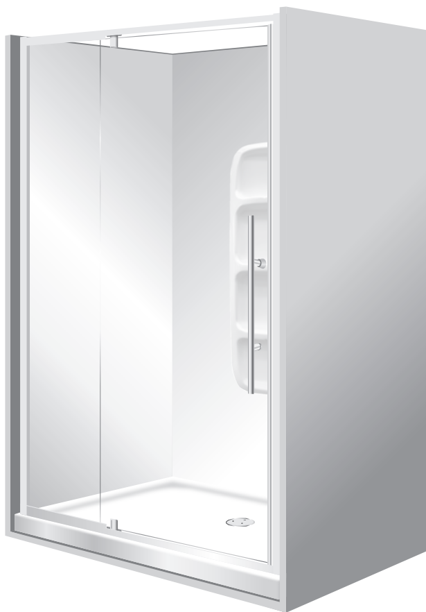
Pictured Above - 900x1200x900 Alcove White Pivot Door Moulded Wall SKU 3614518