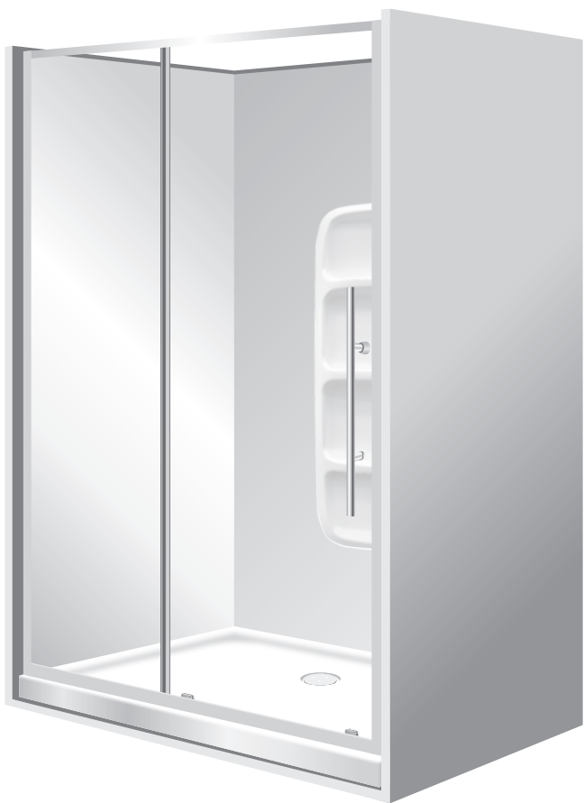
Pictured - Aquero Alcove 900x1200x900 2 Panel Sliding Door White, Moulded Wall