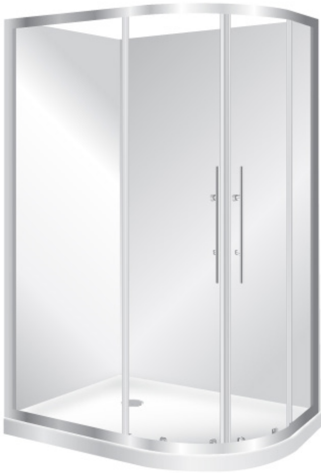
Pictured Above - Curvato 1200 x 800 LH Silva Flat Wall SKU CR12X8SIFWLH