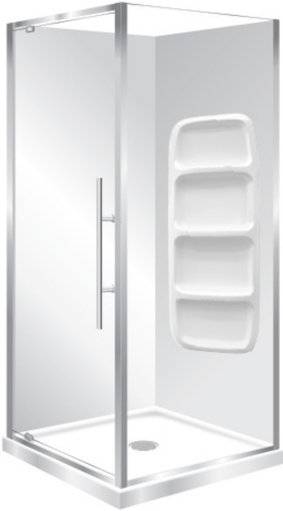
Pictured Above - Aquero 9x9 Pivot Door Silva Moulded Wall