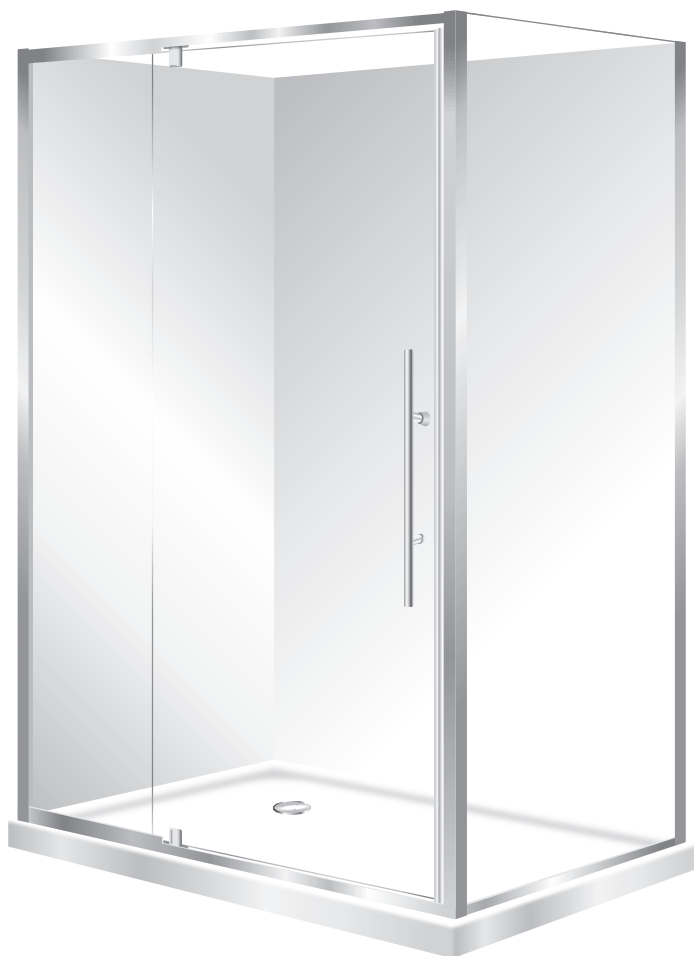
Pictured - Aquero 1200 x 900 Pivot Door Left Hand Tray Configuration Flat Wall Silva SKU 3614511