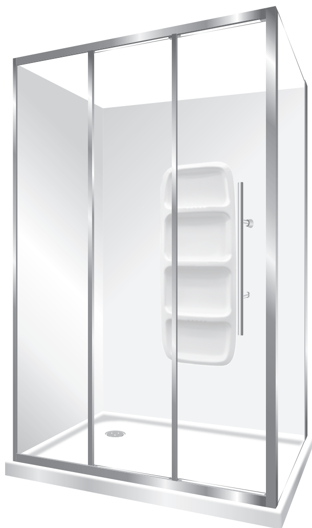
Pictured Above - Aquero 1200x900 3 Panel Stacker Door LH Tray Orientation, Silva, Moulded Wall