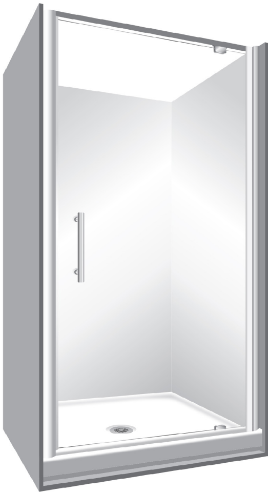
Pictured -Retro 900 pivot door flat wall silva SKU RA900SIFW18