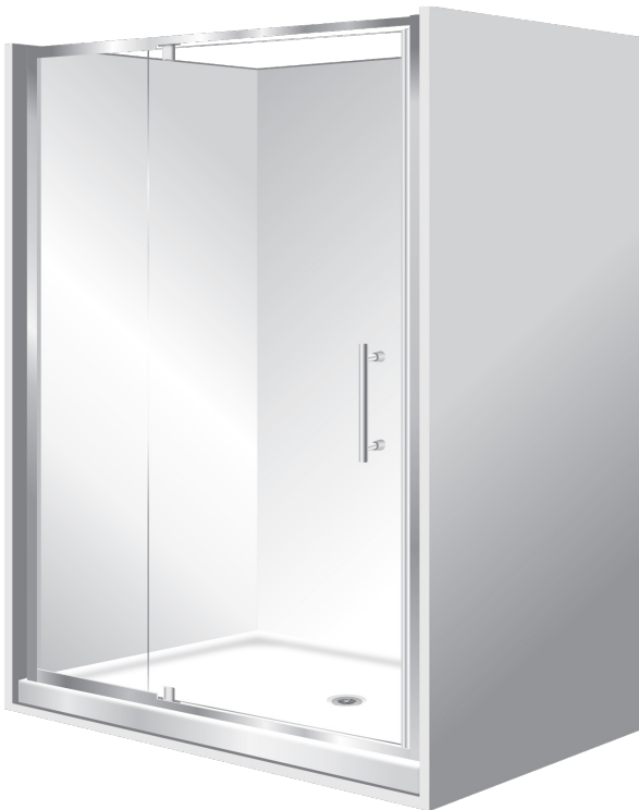
Pictured above - RETRO 900x1200x900 Alcove Silva Pivot Door Flat Wall SKU RA9X12X9SIFW18