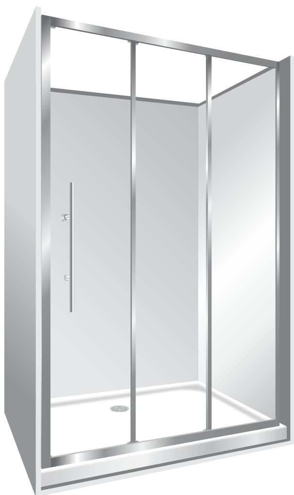
Pictured above - Aquero 800 x 1200 x 800 Alcove 3 Panel Stacker Flat Wall Silva