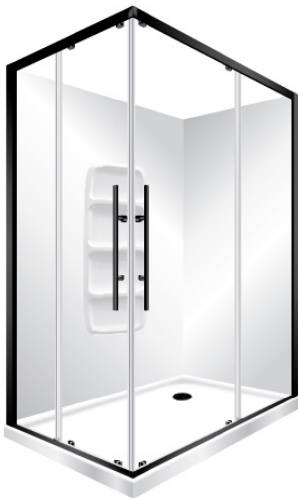
Pictured above - Stellar Twin 90 Rectangular 1200 x 900 RH Black Door Moulded Wall