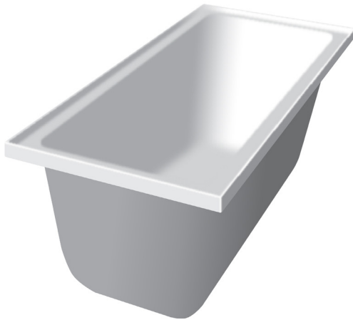
Pictured - Vida 1675mm Bath