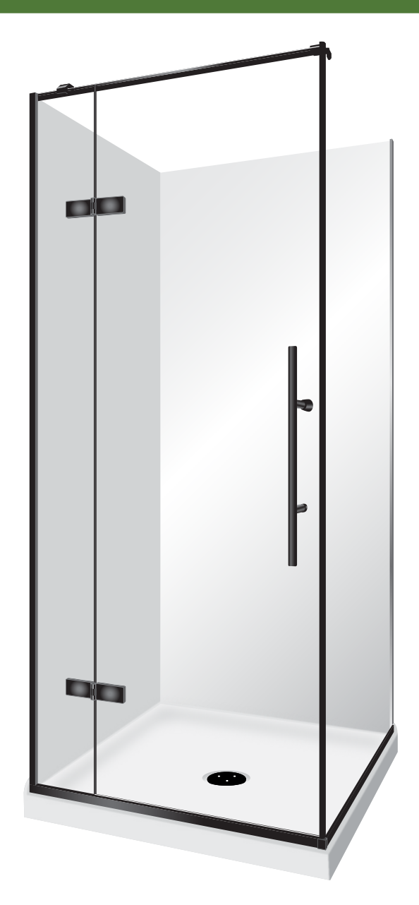
Pictured - 900 x 900 Flat Wall Black SKU: SPF9X9BLFW