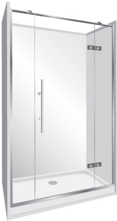
Alcove 1000 x 1200 x 1000 Silva FW