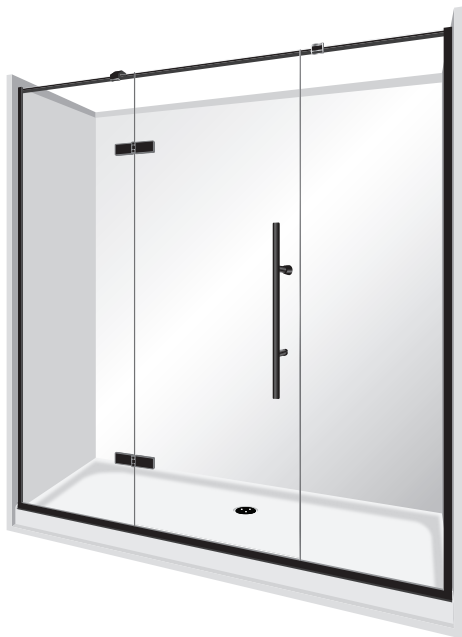
Alcove 900 x 1800 x 900 Black FW