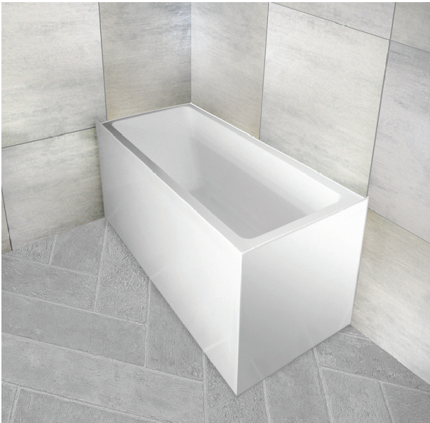
Pictured - Vida freestanding 1675mm bath