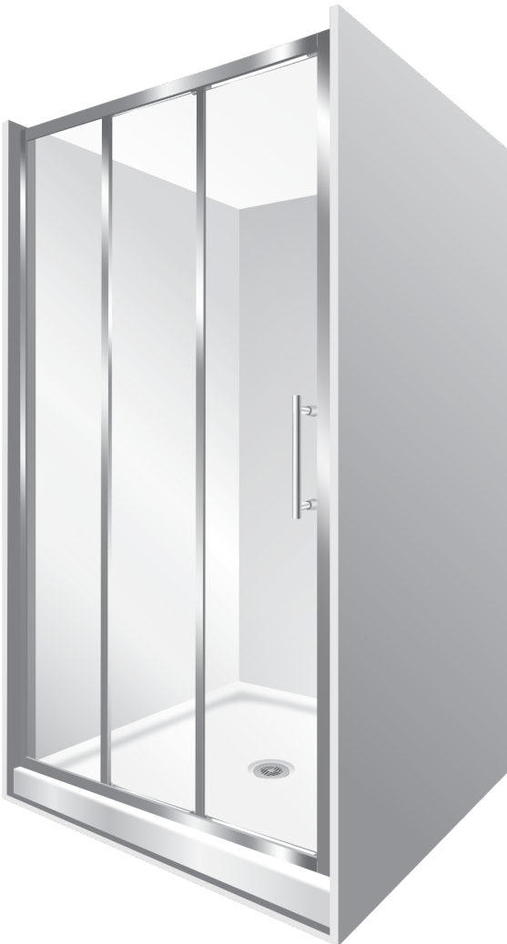
Pictured above - Retro 900 3 Sided Alcove Flat Wall Silva SKU RA900SIFWS18