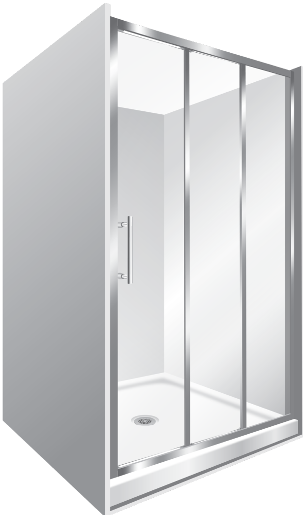
Pictured above - Retro 900 x1200 x 900 Alcove 3 Panel Stacker Flat Wall Silva