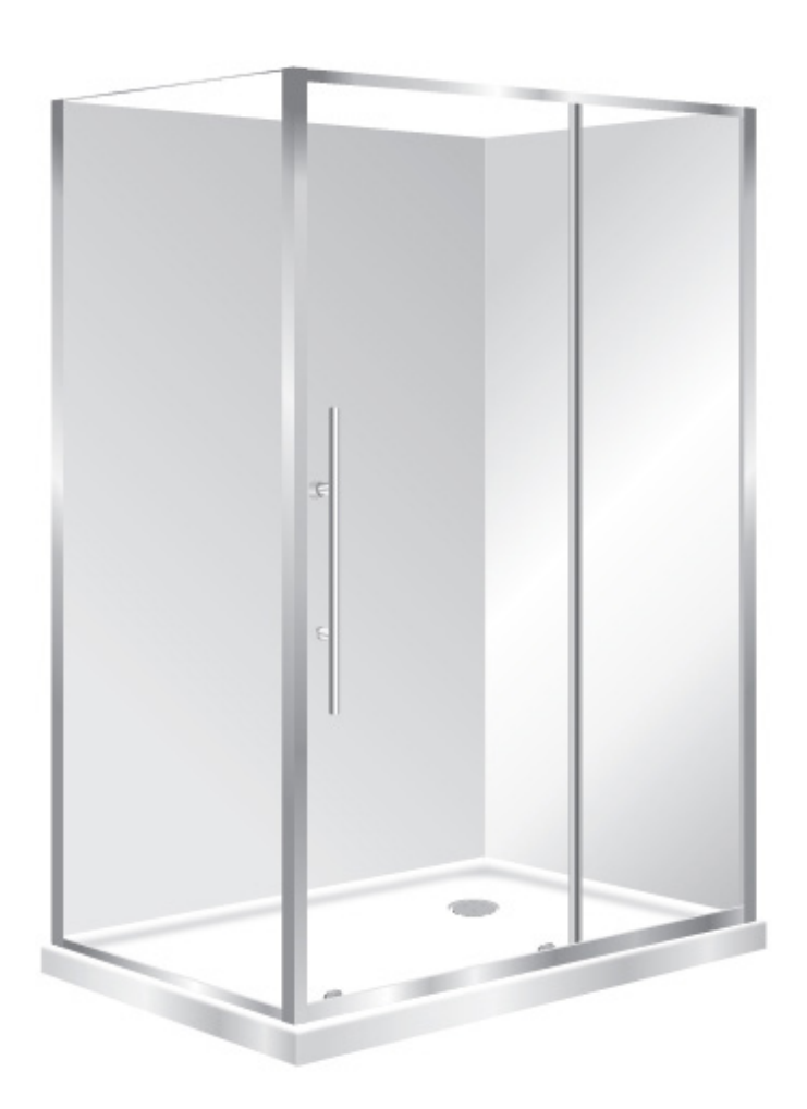
Pictured - Aquero 1200 x 900 2 Panel Sliding Door Right Hand Tray Configuration Flat Wall Silva SKU S12X9AQSRHSIFWZ