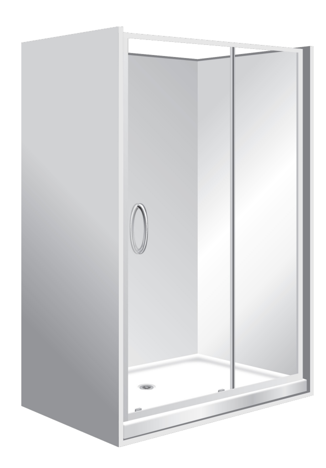
Pictured above - DEZINE 800 X 1200 X 800 alcove SKU S12X8X12DEZSI