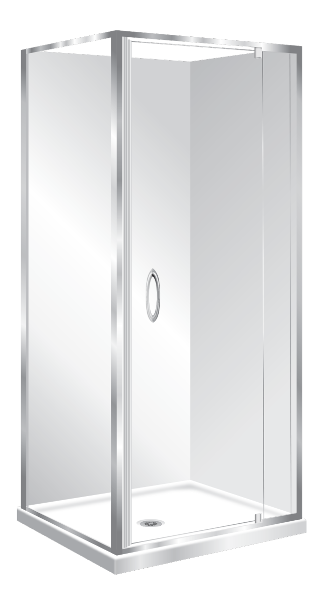
Pictured Above - DEZINE 1000x1000mm Square Shower