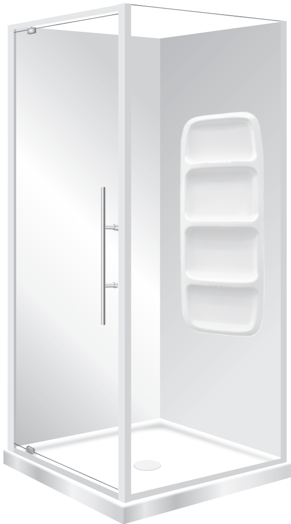
Pictured Above - Aquero 9x9 Pivot Door White Moulded Wall