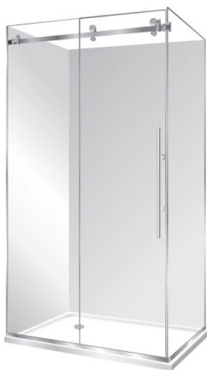
Pictured - Premier Frameless 1200 x 800 2 Sided Silva LEFT HAND Fixed SP12X8SIFWLH