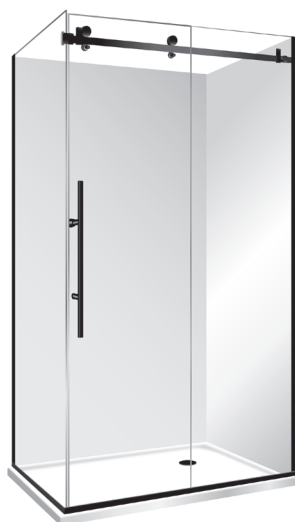
Pictured - Premier Frameless 1200 x 900 2 Sided Black RIGHT HAND Fixed SP12X9BLFWRH