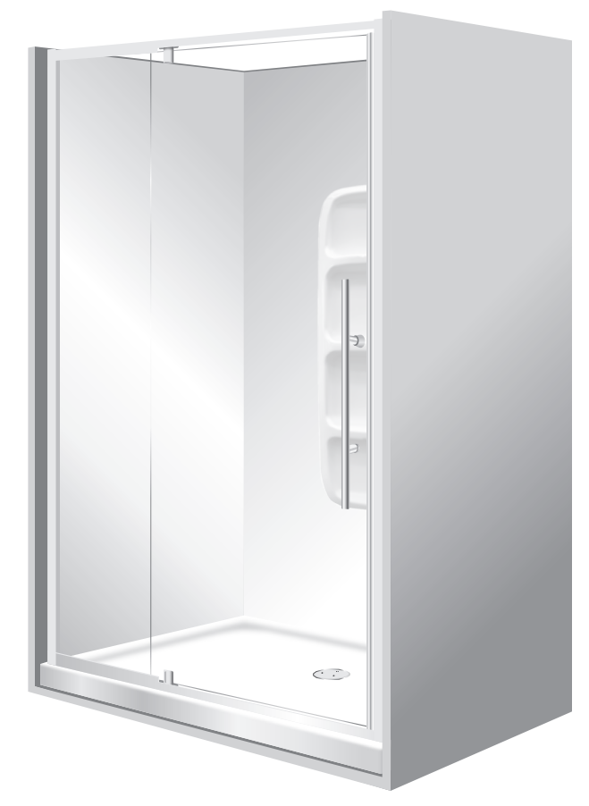
Pictured Above - 900x1200x900 Alcove White Pivot Door Moulded Wall SKU S9X12X9AQAWHMW