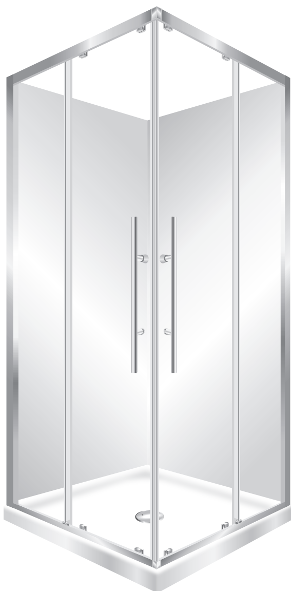
Pictured above - V-Slider 900 Silva Flat Wall SKU - SVS900SIFW