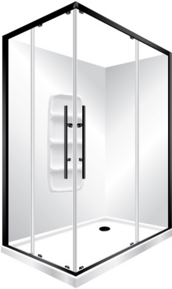
Pictured above - Stellar Twin 90 Rectangular 1200 x 900 RH Black Door Moulded Wall