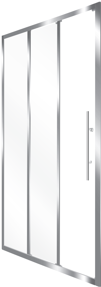
Pictured above - 3 Panel Stacker Door Silva