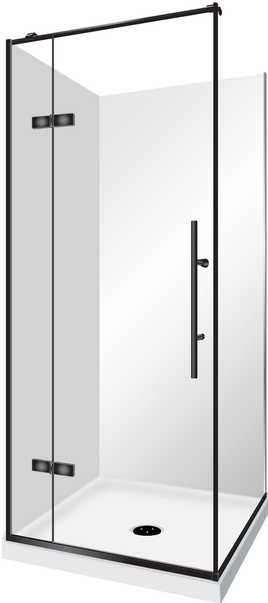
Pictured - 900 x 900 Flat Wall Black SKU: SPF9X9BLFW