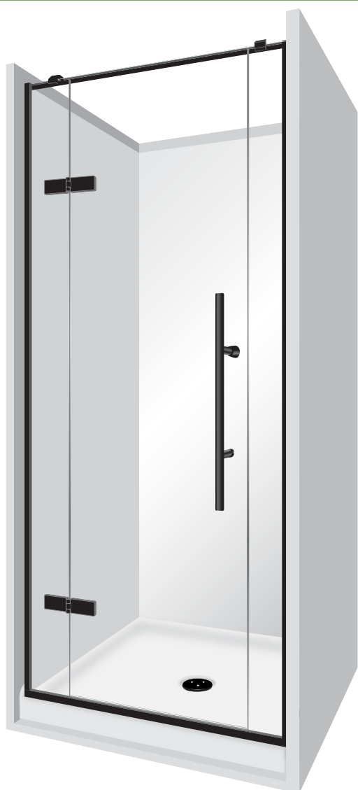
Pictured - 900 x 900 x 900 Alcove Black