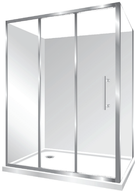
Pictured - RETRO 1200 X 900 mm Left Hand Tray Orientation Silva Flat Wall