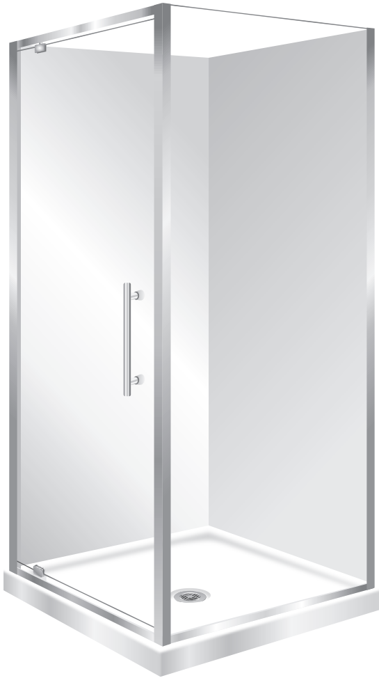
Pictured - RETRO 900 X 900 mm Pivot Door SILVA