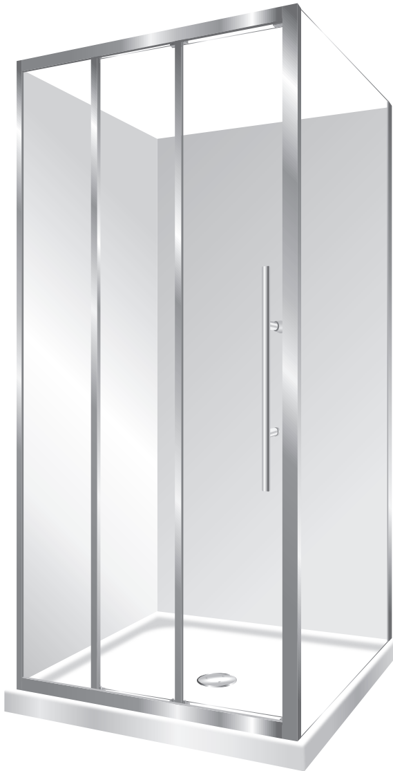
Pictured Above - Aquero 1000x1000 3 Panel Stacker Door Silva Flat Wall