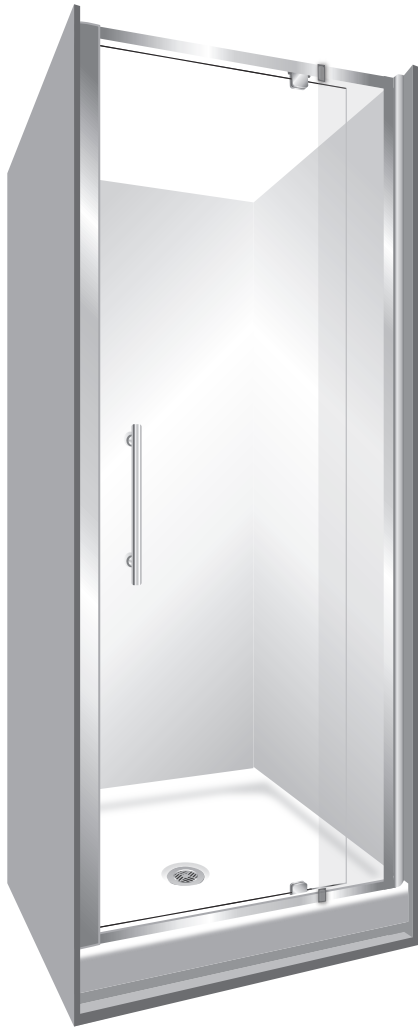
Pictured above - RETRO 900x760x900 Alcove Silva Pivot Door Flat Wall SKU RA9X7X9SIFW18