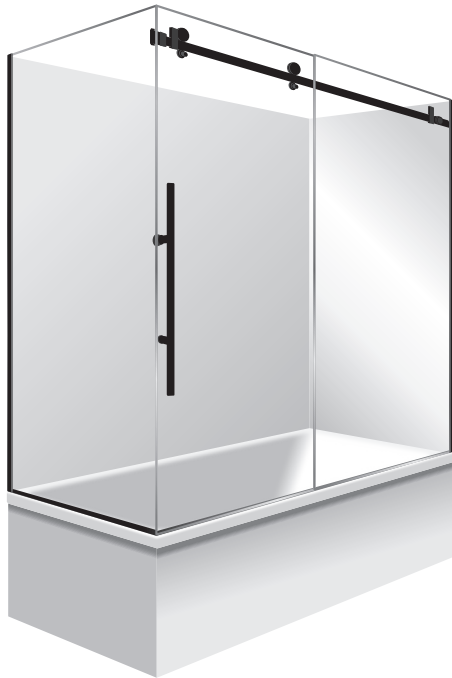
Pictured - Premier Frameless Bath Set RH Black 1675mm SKU: BSP1675BLFWRH