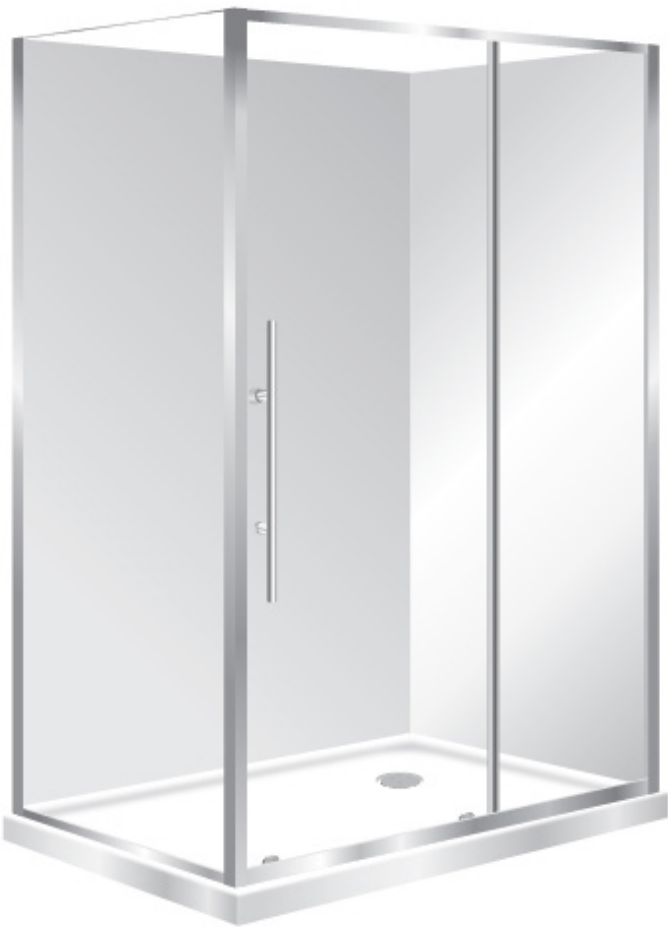
Pictured - Aquero 1200 x 900 2 Panel Sliding Door Right Hand Tray Configuration Flat Wall Silva SKU S12X9AQRSHSIFWZ