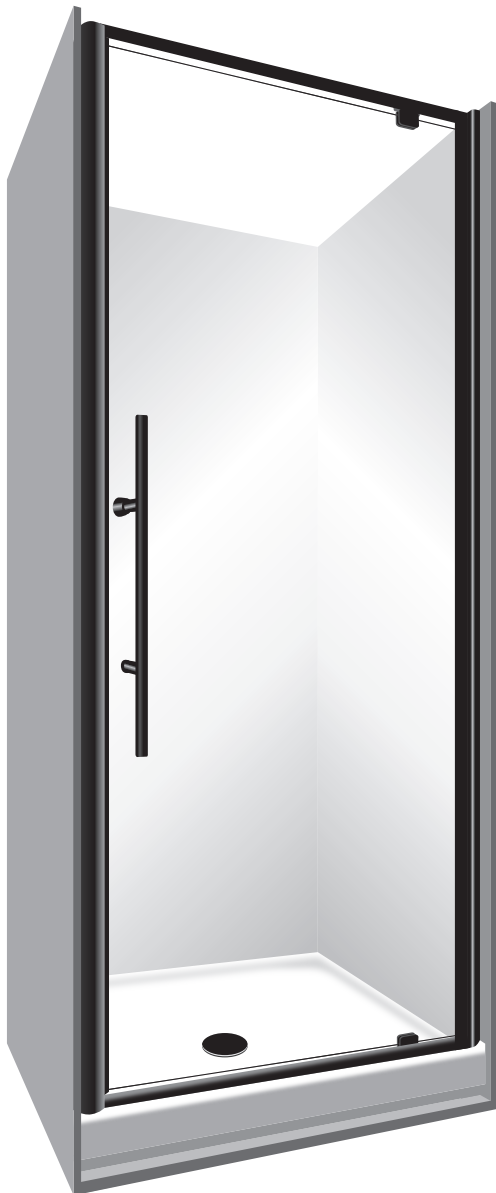
Pictured - Aquero 900 Pivot Door Flat Wall Black SKU S900AQABLFW