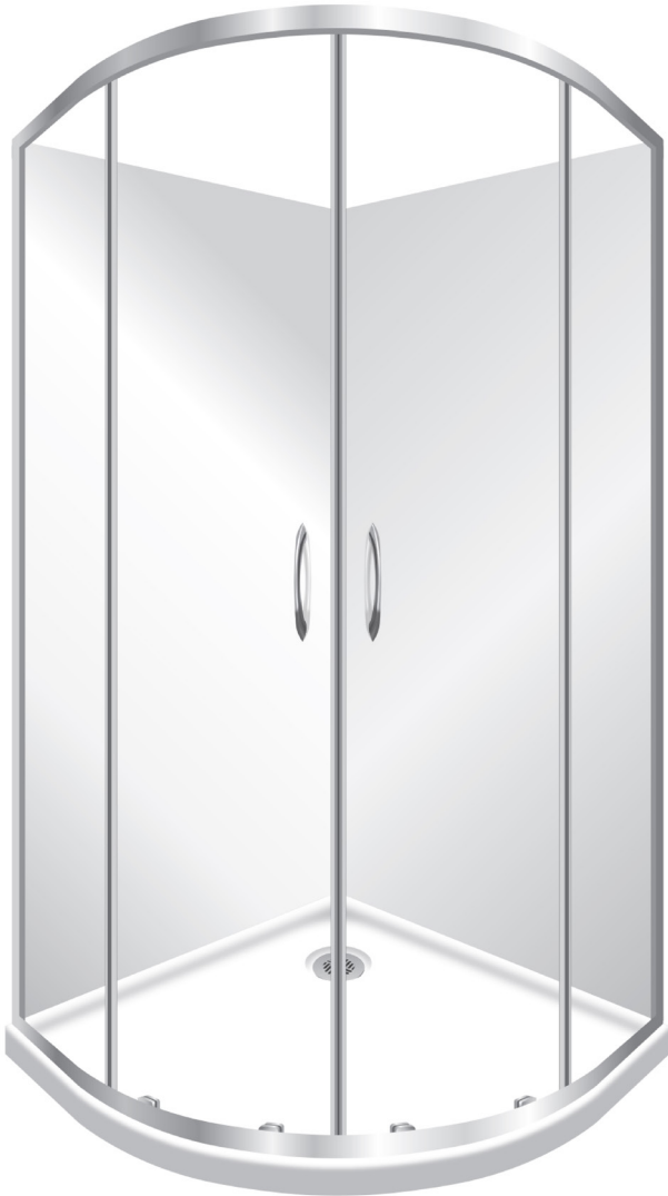
Pictured - Dezine 900 x 900mm Round Corner