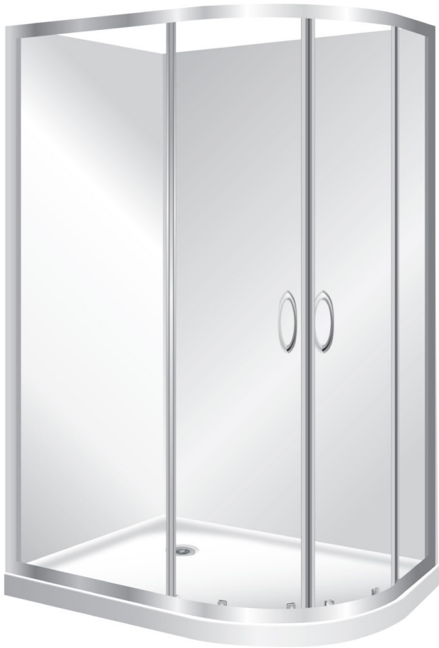
Pictured - Dezine 1200 x 800mm LH Round Corner