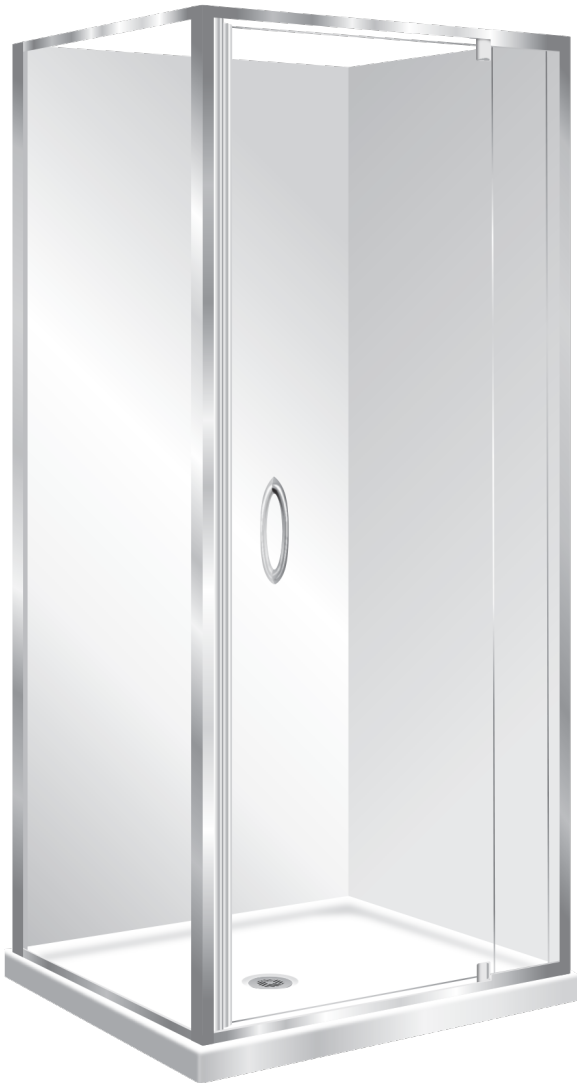
Pictured Above - DEZINE 1000x1000mm Square Shower