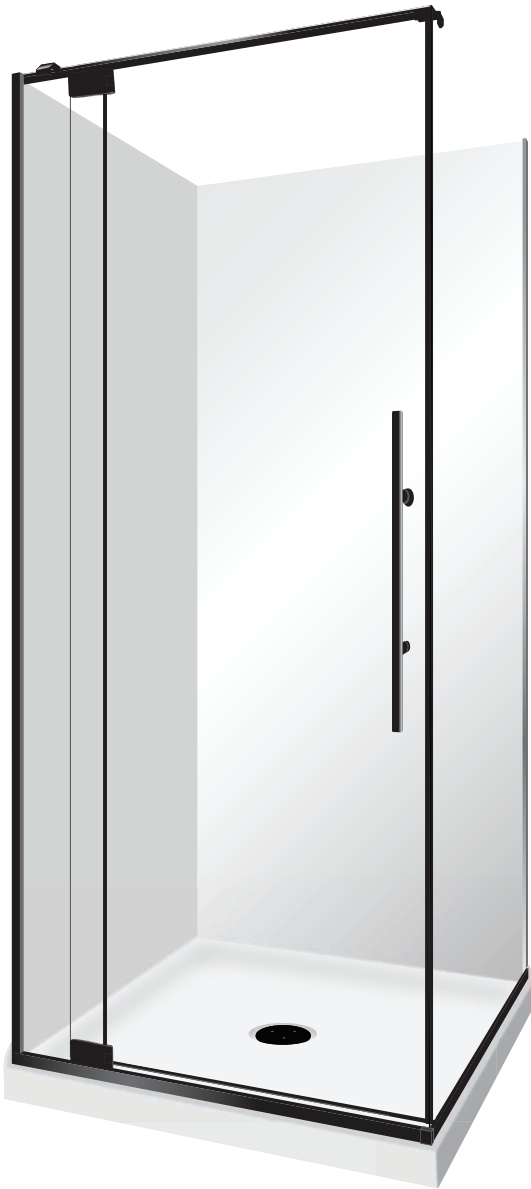
Pictured - 900 x 900 Flat Wall Black SKU: SPF9X9BLFW