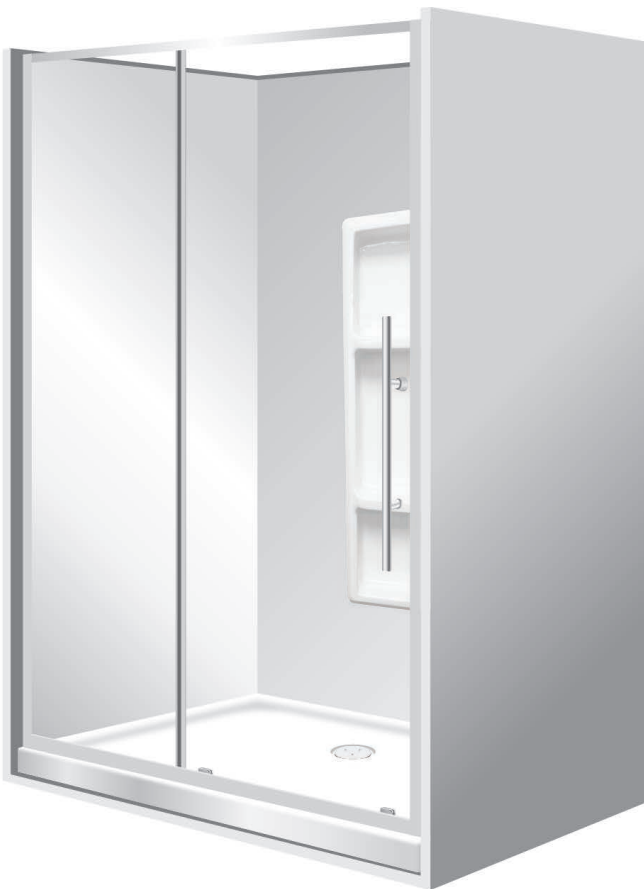
Pictured - Aquero Alcove 900x1200x900 2 Panel Sliding Door White, Moulded Wall