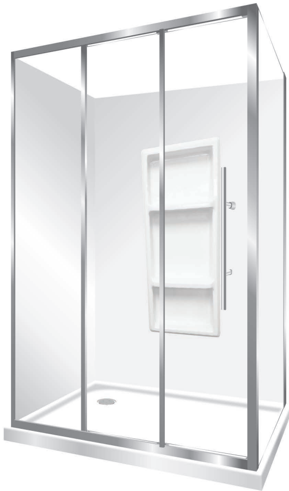
Pictured Above - Aquero 1200x900 3 Panel Stacker Door LH Tray Orientation, Silva, Moulded Wall See SKU S12X9AQSIMWLHS