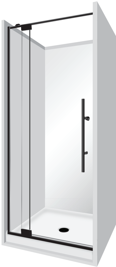
Pictured - 900 x 900 x 900 Alcove Black