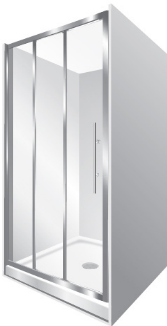
Pictured above - Aquero 900 x 900 3 Sided Alcove Flat Wall Silver SKU S900AQASIFWS