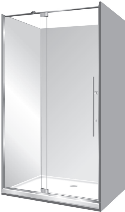
Alcove 1000 x 1200 x 1000 Silva FW