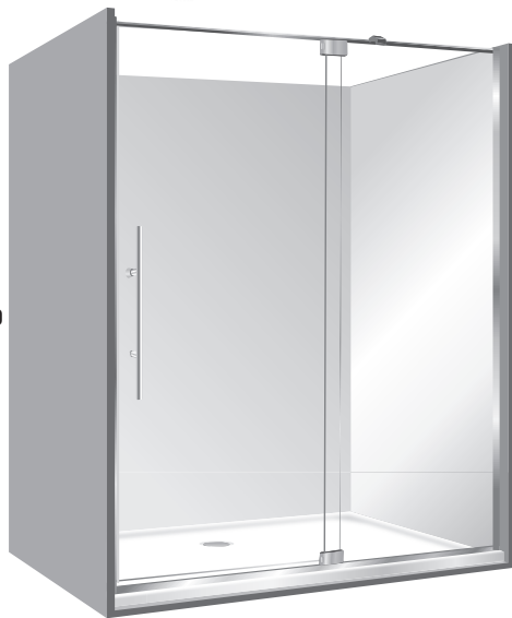
Alcove 900 x 1600 x 900 Silva FW